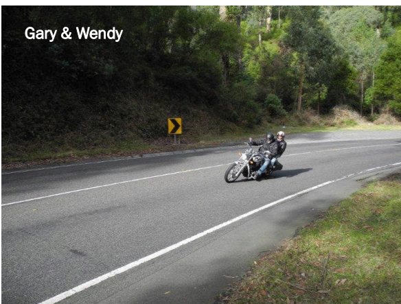
Gary & Wendy

Speed limit is 100kph and the road is in good condition and sweeps through fairly flat farming country with lots of turns which you can see through. This makes it quite safe to power through the bends as you can see traffic (and cops) ahead. Some riders who shall remain nameless chose to hit this road fairly hard whilst the majority of the group had a very pleasant ride without putting their licences in jeopardy. This road ends at Molesworth where we went left and headed to Yea for lunch and eventually home to our various destinations.